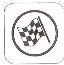
End of regularity test