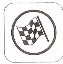
End of regularity test